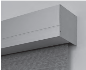
4040 COVERED FASCIA