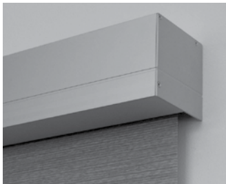
4040 COVERED FASCIA