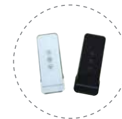
Remote Controllers, 1-Channel