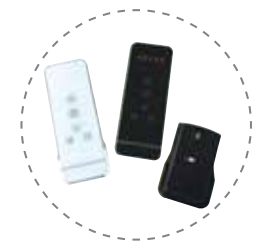
Remote Controllers, 5-Channels

For more information, call us at: 800.828.2500