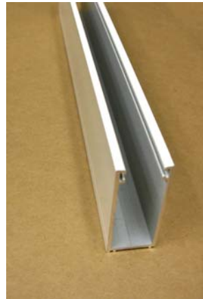
One-Piece Channel, 2 1/2"