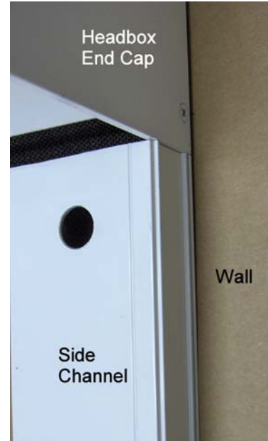
Figure 3 2½" Side Channel Position for Wall Mount