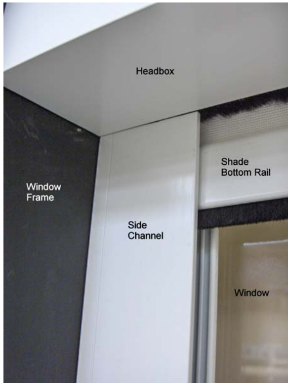
Figure 2 2½" Side Channel Position