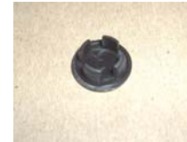
Snap-In Plug (outside mount only)