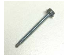
Mounting Screw 1 1/2" self-tapping hex head